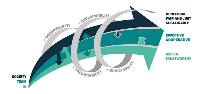
Fig. 4 Development of collective intelligence

techno-centrists, humans are primarily involved in the design and development phases during which engineers and programmers build and train AI technology. For the human-centrists, however, humans not only build the AI, but also they remain important afterwards to warn against AI overlooking humankind's social nature in technological designs, and to interact with the AI throughout its operational lifecycle. Within the collective intelligence-centric perspective, engineers may collaborate with users during construction, implementation, and in everyday practices, as—according to this view—true intelligence is regarded to be seated in the collective of intelligent human and artificial agents.