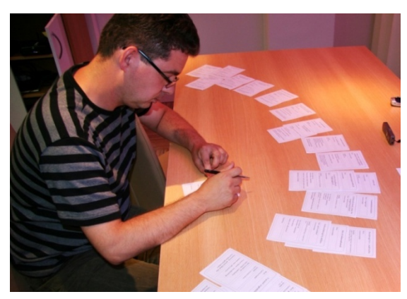
Figure 1: respondent selecting the most relevant use situation aspect cards

Using the use aspect cards, the relevance of the listed use situation aspect with regard to usability was shortly discussed. Subsequently the respondents were asked to select the most relevant cards with regard to usability, see figure 1. These aspects were discussed in more detail including the information source, variance of the aspect and solution that was implemented to accommodate to the use situation aspect. In some cases also other possible solutions were discussed.