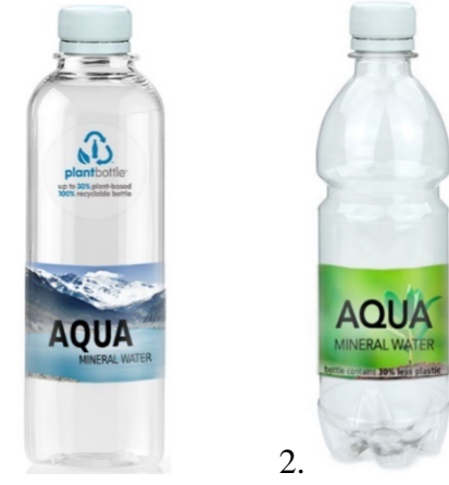
Figure 5: The designs with the highest utility (1) and the lowest utility (2).

According to the question including a price the combination of a blue label, on-label information and minimalistic form was chosen most (21 times), followed by a blue label, on-label information and conventional form (15 times) and a blue label, on-bottle information and minimalistic form (12 times). Buying intention thus seems to be greatest for the blue label, on-label information and minimalistic form, which is not fully in line with the utility scores from the rankings. The blue label and minimalistic form also have the highest utility according to the rankings, whereas on-bottle information has a higher utility than on-label information.