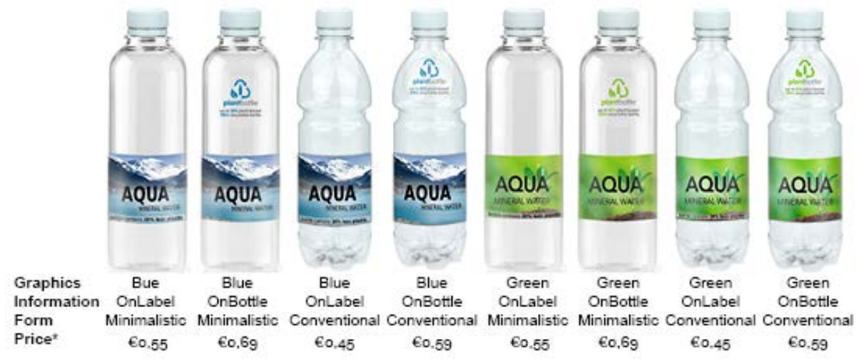
Figure 2: Designs for the conjoint analysis *Prices are only included in the second last question of the survey

A full profile conjoint analysis was conducted to identify which of the resulting features from the pre-study were dominant. For each of the three factors (graphics, information, form) were two possibilities: a sustainable and a neutral design. This resulted in a 2x2x2 conjoint design with eight profiles as shown in Figure 2.