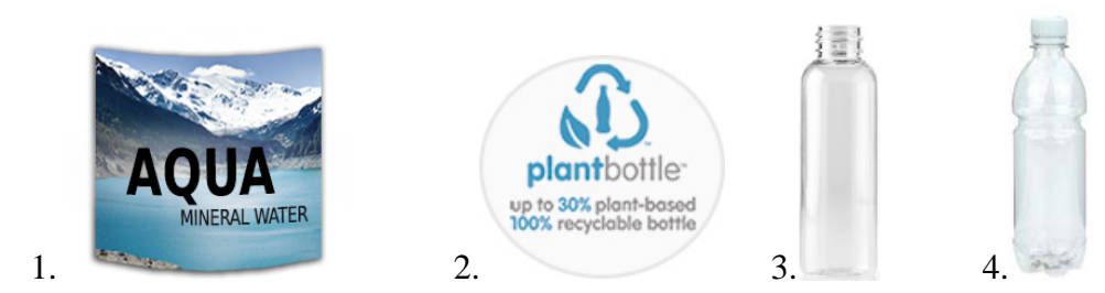
Figure 4: Blue label (1), OnBottle information (2), Minimalistic form (3), Conventional form (4)

The minimalistic form and on-bottle information were the sustainable designs of the form and information according to the pre-test. For graphics the green label was the more sustainable variant, however in the rankings the neutral looking blue design was pointed out as most sustainable of the two which is therefore not as expected. This could be explained by the fact that the label contains nature imagery and shows more congruency with water, which can trigger a more natural feeling. According to the importance values in Table 2, graphics clearly matter the most (average of 44,462), followed by information (average of 29,809) and form (average of 25,729). Regarding the ranking on appeal and sustainability there is no significant difference between the importance values of information and form. The minimalistic form has the highest