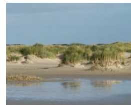
Examples of current Dutch and Belgian dune research.