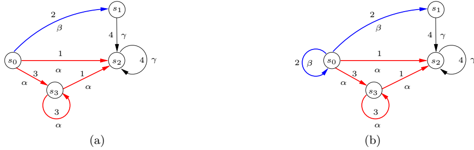
Fig. 3. An example illustrating why uniformization on CTMDPs is not obvious