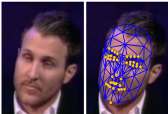
Figure 1: A player's face before and after it is matched by the 3d face mask mesh.