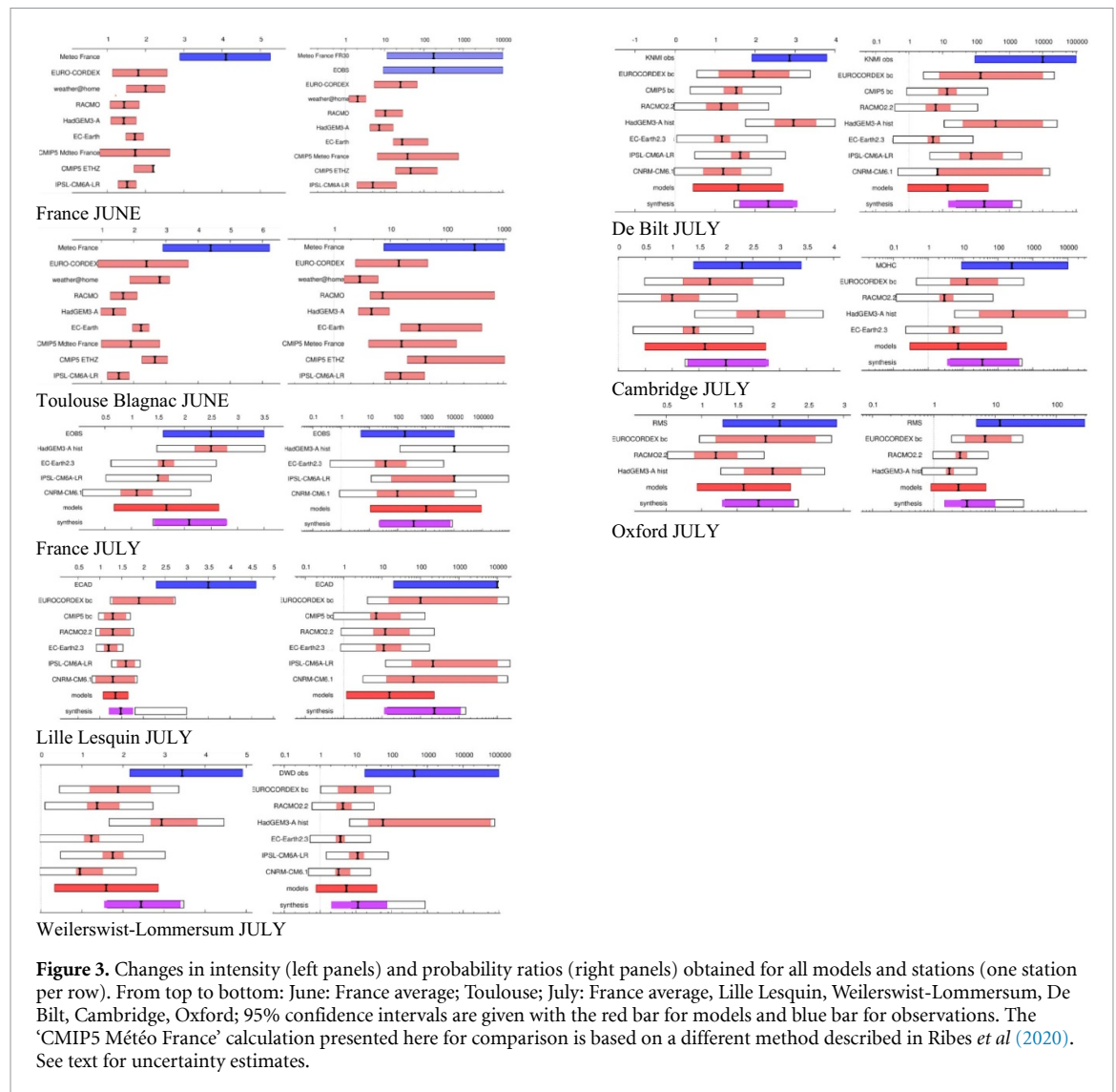
Figure 3. Changes in intensity (left panels) and probability ratios (right panels) obtained for all models and stations (one station per row). From top to bottom: June: France average; Toulouse; July: France average, Lille Lesquin, Weilerswist-Lommersum, De Bilt, Cambridge, Oxford; 95% confidence intervals are given with the red bar for models and blue bar for observations. The ‘CMIP5 Météo France’ calculation presented here for comparison is based on a different method described in Ribes et al (2020). See text for uncertainty estimates.

observations leads to an increase of a factor of about 10 (at least 3).