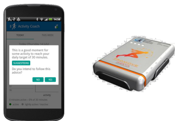
Figure 1 Technology modules; left: smartphone application, right: activity sensor.

remain physically healthy, sitting time and the length of sitting periods need to be reduced. 9