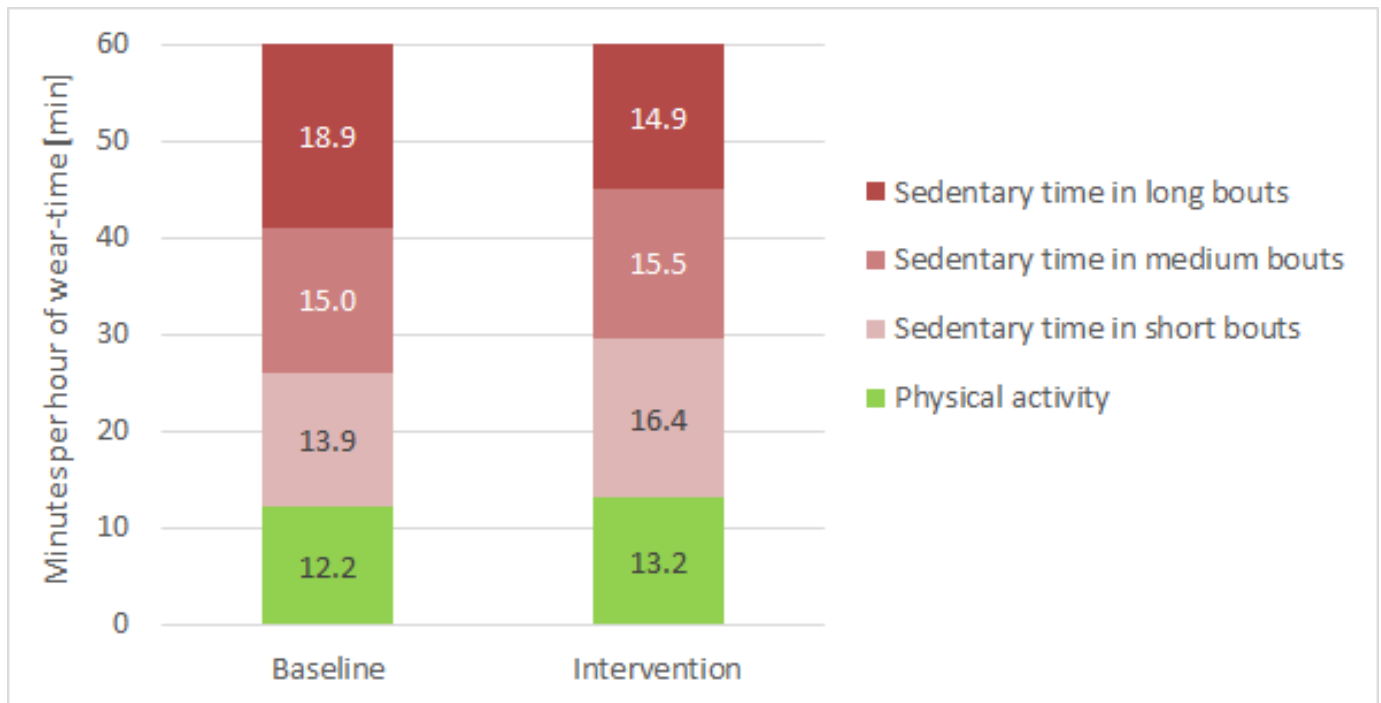
Figure 3 Distribution of the average time per hour of wear time as sedentary or physically active.

Most participants stated that the intervention created awareness on their physical activity and sitting behaviour (n=9) and provided insight in their physical activity pattern (n=9). Physical activity suggestions (n=3) were appreciated, as well as the graphical user interface (n=2). Negative aspects mentioned by the participants mainly concerned the timing of suggestions (n=10), the size of the sensor (n=6) and losing wireless connections (n=2). Participants suggested to improve the timing of suggestions in such a way that it is not disturbing them (eg, not when being in a creative process, while lecturing or a while after being physically active).