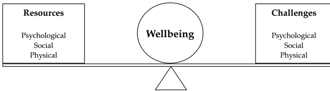
Fig. 2. Definition of Wellbeing depicted as see-saw according to (Dodge et al., 2012).

to make decisions that have consequences about life and death. In the discussion, there was unanimous agreement that a machine should not decide when life-supporting systems can or should be switched off.