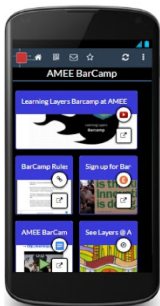
Figure 3: the Learning Toolbox stack from the Learning Layers project