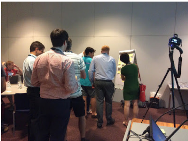
Figure 2: topic voting in progress