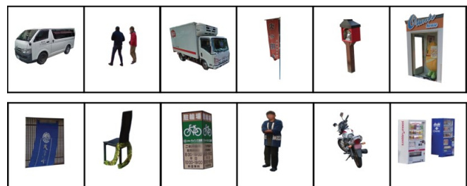
Figure 1: Examples of visual stimuli located along Google Street View routes A (top) and B (bottom).

To assess performance differences between monitor and HMD conditions, we measured participant memory of two virtual routes and objects present along these routes by recording route navigation errors as well as correct object recognition numbers and accompanying response times. Map drawing quality was determined by comparing drawn