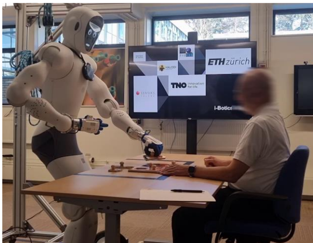
Fig. 3. Interaction between someone in the remote environment and the user present through the telepresence robot. They are working together to complete puzzle.

The universal pod was developed by means of a user-centric design approach to ensure that a novice user can operate the system and enjoy the complete immersive experience without extensive training. We have developed a specialized training protocol that requires less than 30 minutes to complete and that allows the user to interact with objects and people in the remote environment in an intuitive way, for instance, to do a cooperative puzzle task as depicted in Fig. 3. Informal evaluations with eight naïve users confirm that the system is easy to learn, results in a high level of telepresence and embodiment, and allows users to feel socially connected with people at a distance. We will complete formal evaluations in the near future.