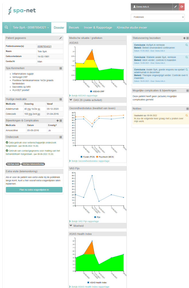
Figure 2 Example of SpA-Net interface for healthcare providers. For healthcare providers, the SpA-Net dashboard environment is divided into three columns. The first column displays patients' personal information, presence or history of SpA features, current medication and history of medication-related adverse events. The second column contains graphical summaries of the following ePROMs and disease activity measures: ASDAS, SF-36, VAS Pain, VAS Fatigue (accessible in a drop-down box 'v'), ASAS Health Index. The third column contains summaries of most recent visits, complications or side-effects reported by patients and patient's notes or questions. ASDAS, Assessment of SpondyloArthritis International Society; ASDAS, Ankylosing Spondylitis Disease Activity Score; CRP, C reactive protein; ePROMs, electronic patient-reported outcome measures; MCS, SF-36 Mental Component Scale; PCS, SF-36 Physical Component Scale; SF-36, 36-Item Short-Form Health Survey; SpA, spondyloarthritis; VAS, Visual Analogue Scale.

In the intervention group, no additional pre-booked appointments are provided. Instead, 'remote monitoring' will take place after 6 months. Two weeks prior to the planned remote monitoring, these patients will receive a reminder email to complete questionnaires in SpA-Net and to have routine blood tests. Rheumatologists receive an automated email notification as soon as all questionnaires have been answered. Responses to questionnaires and laboratory results are subsequently reviewed by the rheumatologist. Rheumatologists' notes are visible to patients and, at minimum, need to include a summarised interpretation of the patient's results as well as a treatment and follow-up plan. If needed, a physical visit or telephone consultation can be planned (on request via SpA-Net, telephone or email) by the patient, replacing the remote monitoring procedure, or by the rheumatologist