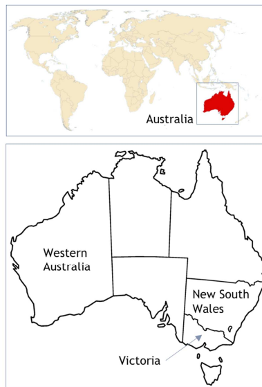
Figure 1. The case study jurisdictions

The final phase involved drawing together the results of the three case studies and the specific drivers they uncovered. During this process validation took place by determining overlapping interests and drivers, identifying recurring problems, and drawing out key themes. The drivers were organized into a generic model. Final validation and refinement was undertaken by testing the generic drivers against the respondent data from the 42 countries involved with the Cadastral Template (Rajabifard et al , 2007).