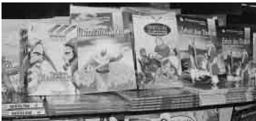
Figure 4. Examples of Children’s Books with Jihad Theme

All these books... contextualize as well as justify jihad