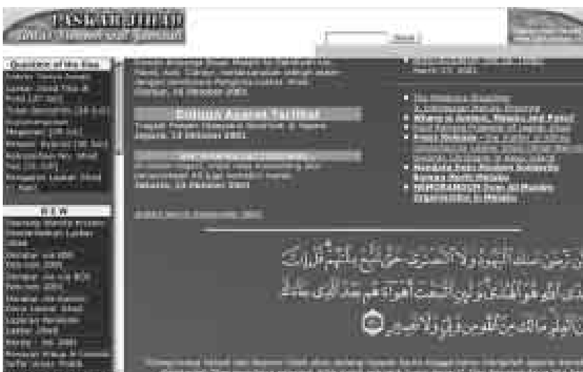
Figure 2. Laskar Jihad Online Snapshot