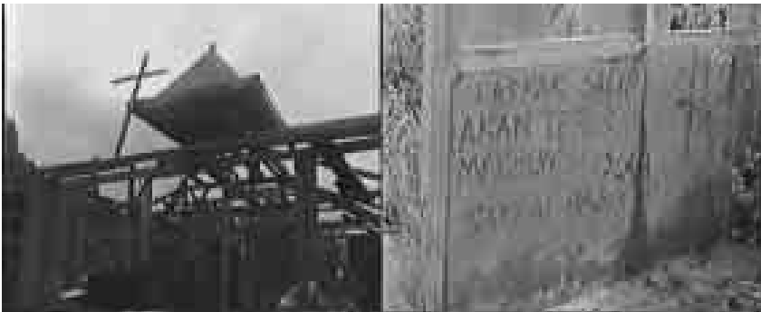
Figure 3. Example of Graffiti that Insults Islam