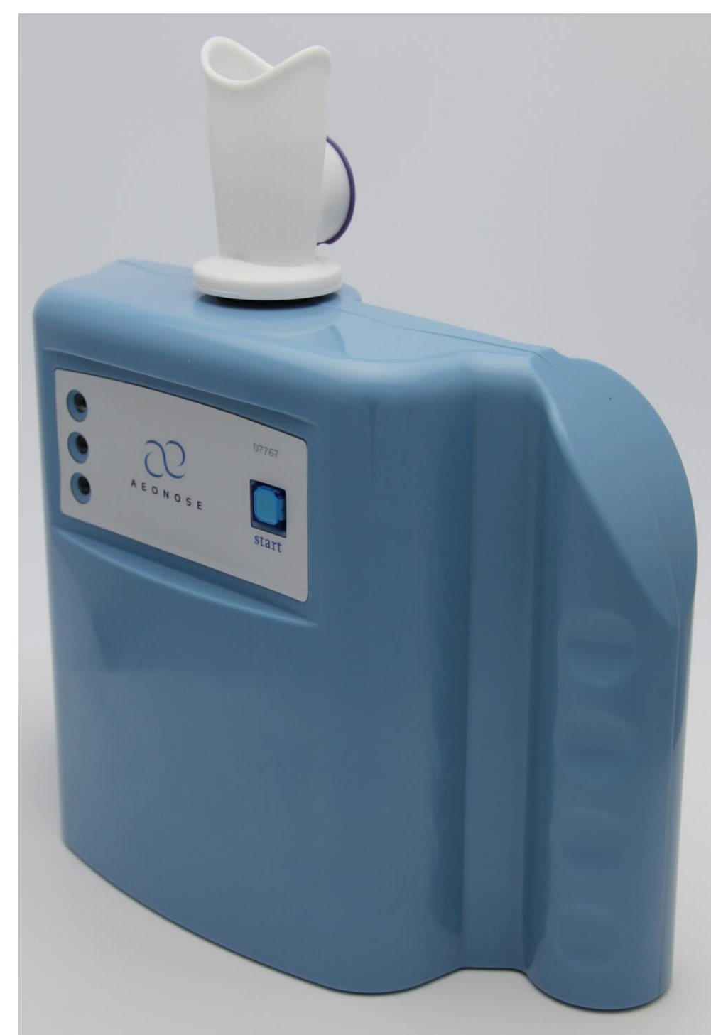
Figure 1: The Aeonose™

Patients seen at the emergency department that received a CTPA scan due to suspected PE (based on increased D-dimer or Wells-score) breathed normally into an electronic nose (the Aeonose™, The eNose Company, Zutphen, the Netherlands, see figure 1) for five minutes. The Aeonose™ measurement data were compared with the CTPA result to train an artificial neural network. Resulting Aeonose™ classifications into PE or no PE were obtained using Leave-10%-Out cross validation. For full details on the analysis see Kort et al.[1].