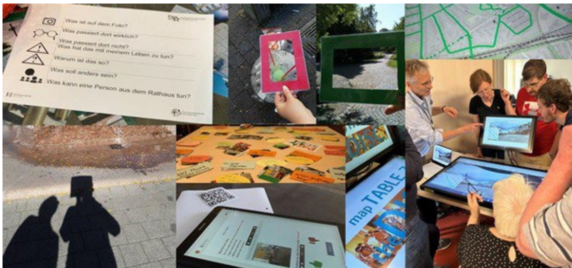
Figure 2: Workshops in the DiMDiCi Project - photovoice and interaction among co-researchers.

In the DiMDiCi project, one lesson learned was crucial towards developing a more user-friendly software. Visualization of the third dimension by including a 3D photorealistic visualisation of space on the mactable was helpful for the participants. The diversity among co-researchers, each with varying levels of map literacy, underscores the importance of tailoring software for inclusivity. The insights gained from this project have led to continuous refinement, and the research team at the University of Twente committed to further development of the OGITO software beyond the scope of this study.