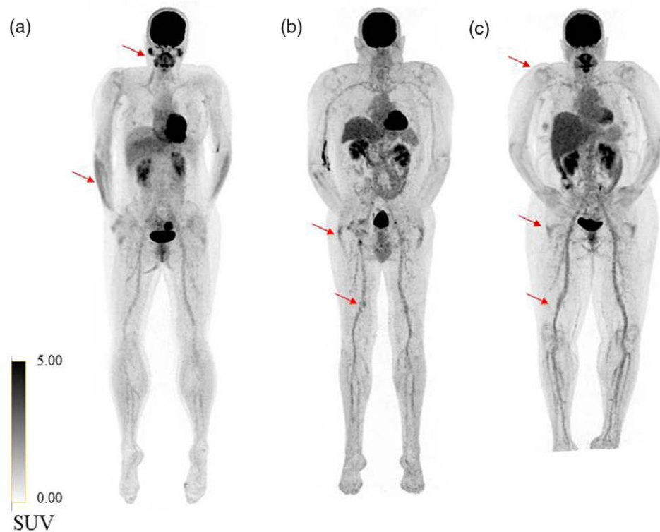
Examples of three long COVID patients with persistent symptoms of fatigue, myalgia or joint pain. (a) High to moderate [ 18 F]FDG-uptake in the m. brachioradialis and parotid glands (red arrows). (b and c) Low to moderate [ 18 F]FDG-uptake in joints and vessels in the lower extremities (red arrows). COVID, coronavirus disease.

the EANM recommendations for [ 18 F]FDG-PET/CT imaging in LVV and polymyalgia rheumatica: thoracic aorta, abdominal aorta, subclavian arteries, axillary arteries, carotid arteries, iliac arteries and femoral arteries [22]. Additional targets consisted of the parotid glands, shoulder girdle and hip girdle (analysis of 10 targets, performed on all patients). Additionally, the tibial arteries, lower arm muscles and hands were assessed if visible on the scan (analysis of 13 targets, performed on patients with total body scans). A standardized 0–3 grading system was used to assess all targets, and was defined as follows: 0 = physiological [ 18 F]FDG-uptake; 1 = minimally heightened [ 18 F]FDG-uptake (<mediastinum), 2 = clearly increased [ 18 F]FDG-uptake (≥mediastinum and <liver), 3 = very marked [ 18 F]FDG-uptake (≥liver). The 10 or 13 targets per patient were assessed independently by two experienced nuclear medicine physicians (S.M.d.B., R.S.A.) who were blinded. The TVS was calculated as the sum of all target scores.