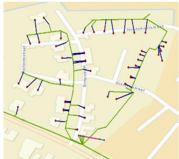
Figure 1: A map of De Veldegge. The electricity cables are shown in green, the connection cables in blue, the houses in red, and the transformer is in pink.

The only way we can influence the loads within the network is by sending control signals to the 24 placed batteries, and by sending incentive signals to the households. The occupants of the household can then decide to act based on the incentive signals.