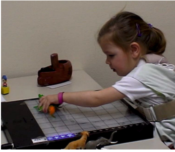
Fig. 2. A young girl playing the animal game