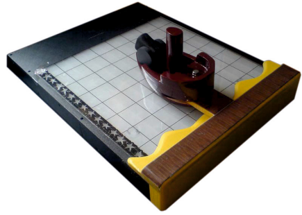
Fig. 3. The final version of the tangibles used for the boat shooting game

‘funny’ sounds is played and a point is awarded. If the wrist is raised while hitting, this is indicated by playing a spoken text. Once 16 points are achieved the game is won and the border of the board flashes green for several seconds.