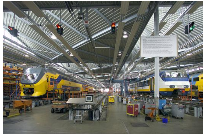
Fig. 1. A workshop of NedTrain

Maintenance of trains that are operated by the Netherlands Railways is carried out at the workshops of NedTrain (for example the workshop presented in Figure 1). In these workshops different types of trains are maintained using the available maintenance equipment. During the development process of both completely new trains and renovation of currently used train sets, the maintenance aspects are addressed in relation to these available resources.