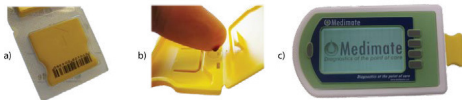
Figure 1. Lithium measurement: a) shipped blister including the prefilled \mu\text{CE} chip assembled into a plastic disposable for ease of handling and sample application b) application of a single blood droplet c) disposable inserted into the Multireader including high voltage power supply and conductivity detection unit. The measurement is done typically within 2 minutes.

A closed and prefilled microfluidic system, as presented here, puts new demands on design aspects to fullfill shipping requirements and shelf life. In order to compensate for thermal fluid expansion a gas bubble (app. 0.5\mu\text{L} in volume) was integrated. As shown in figure 2 in the close-ups, the integrated gas bubble shrinks as the encapsulated fluid expands with an increasing environment temperature (here: 22^{\circ}\text{C} to 70^{\circ}\text{C} ).