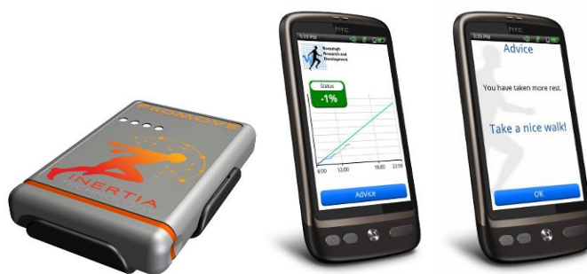
Figure 1: The Activity Monitoring and Feedback system from Roessingh Research and Development. Depicted is the ProMove-3D activity sensor, and two screenshots of the Smartphone interface showing a graph of daily activity and a motivational message.

The system that was used in our activity monitoring and feedback research is depicted in Figure 1 below. On the left is the ProMove-3D physical activity sensor, developed by Inertia Technology; in the center is a screenshot of the Smartphone interface showing a graph of daily activity, and on the right is a screenshot showing a motivational advice (feedback) message: "Take a nice walk!".