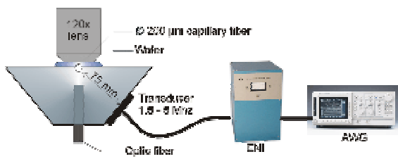
Figure 1. Experimental setup.

immersed objective and a 2x magnifier produced an image of the contrast bubbles. The image was then relayed to a high speed framing camera (Brandaris 128 [7]), resolving the insonified microbubble dynamics. An arbitrary waveform generator, a Tektronix AWG 520, was used to produce waveforms. An ENI A-500 amplifier was used to amplify the waveforms.