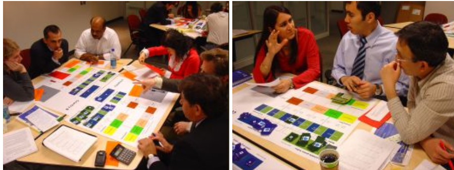
Fig. 2. Playing the Globalization of Water Role Play.