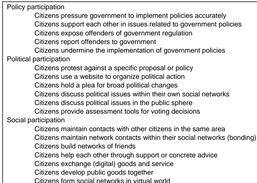
Figure 2: Overview of categories of public participation

This mapping exercise has resulted in the following overview of categories of public participation: