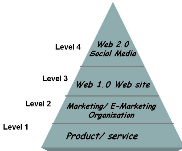
Fig. 2. The position of Web 2.0 within the (E-) Marketing program