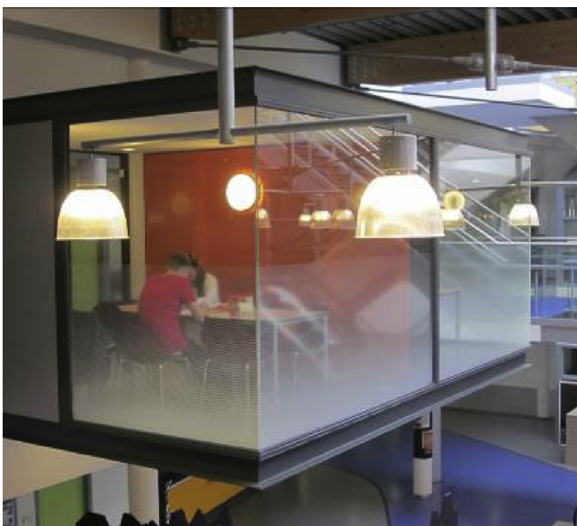
Fig. 3. Learning space in a quiet, closed area.

activities is small ( t(677) = -8.82, p < 0.001, d = 0.35, 95\% \text{ CI} [-0.41, -0.26] ), busy public areas are not preferred at all for study activities.