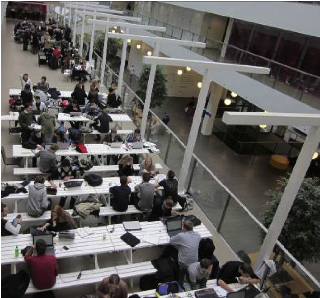
Fig. 2. Learning space in a busy, open area.