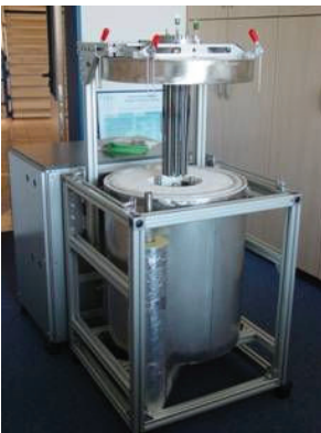
Fig. 3: Demonstration unit for the oxygen separation from air