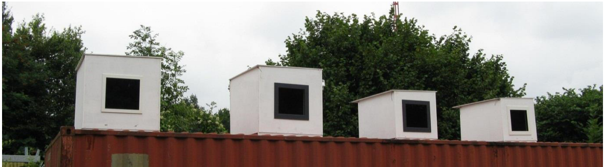
Fig. 1. Four insulated boxes containing concrete floors, with and without PCMs, as part of our experimental set-up at the University of Twente [29].

Although the Netherlands are not known for their high temperatures or high levels of solar irradiance, the data collected in June 2010 showed that the PCMs in combination with an advanced glazing system helped to increase minimum temperatures by 7\pm 3\% in the boxes with light weight thin insulation. Furthermore, it helped to decrease maximum temperatures by 11\pm 2\% in the boxes with light weight thin insulation and 16\pm 2\% in boxes with heavy weight thick insulation. Analysing the experiments raised considerations which one should be aware of when applying PCMs in dwellings: