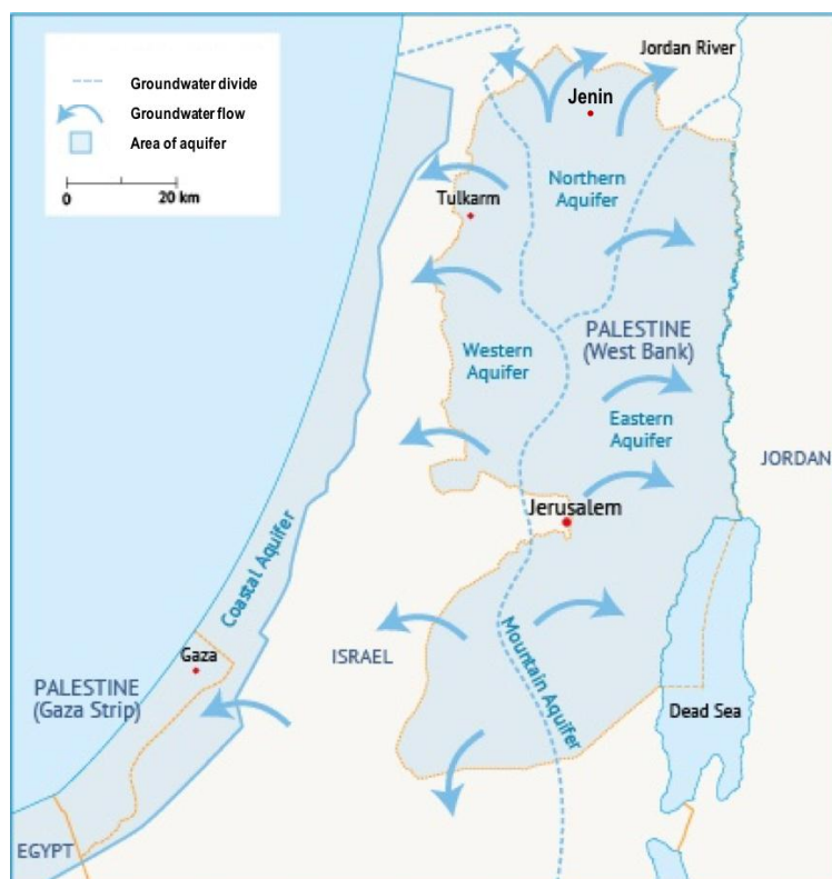
Figure 1. Main water resources of Palestine.